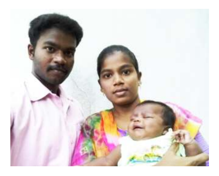
NOCPL Connect wishes a future filled with love, happiness, and laughter to the proud parents who welcomed their new born in the last quarter!